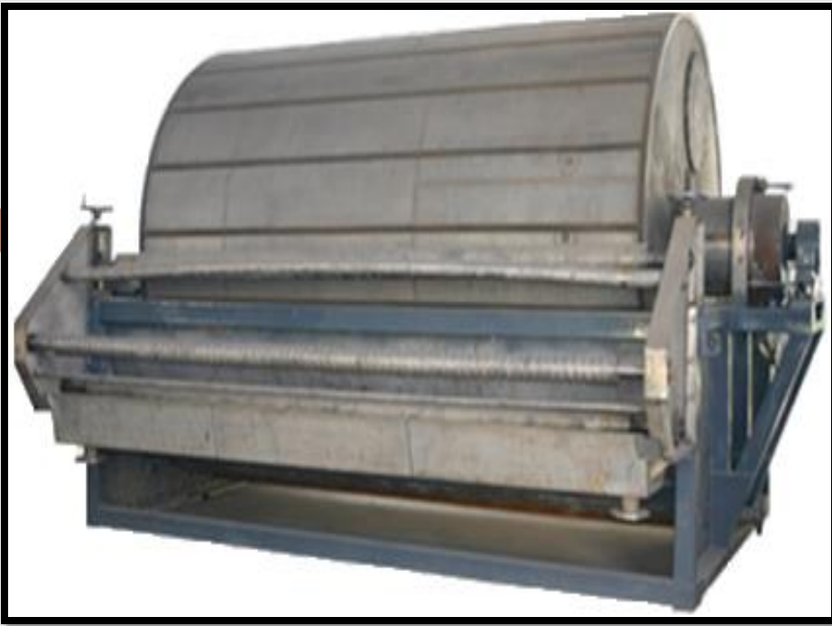
Rotary Drum Filter